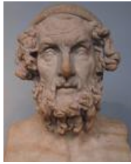
750 BC Homer