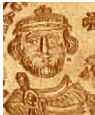
620 AD Heraclius