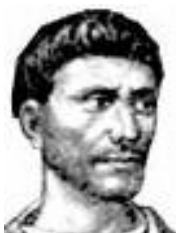
250 AD Diophantus