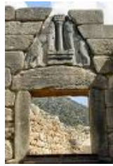
1150 BC Ruins of Dorian Invasion