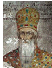
1300 AD Andronicus II Palaeologus