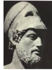
450 BC Pericles