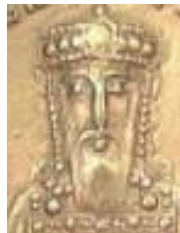
950 AD Constantine VII Porphyrogenetus