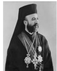
1960 AD Makarios