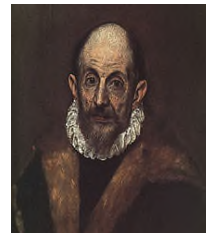
1610 AD Domenikos Theotokopoulos (El Greco)