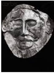
1500 BC Mycenaean Mask